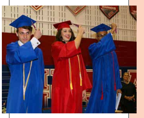
Grads switch mortarboard tassels from right to left at ceremony's conclusion.

Donations are always welcome. Individuals can send their taxdeductible contributions to the Piqua Education Foundation, 719 E.ast Ash St. Piqua, OH 45356.