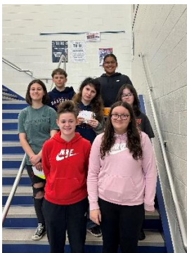
March 7 th Grade