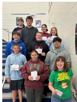
March 8 th Grade