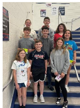
April 7 th Grade