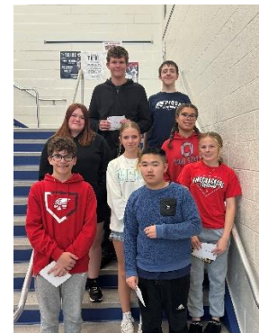
April 8 th Grade