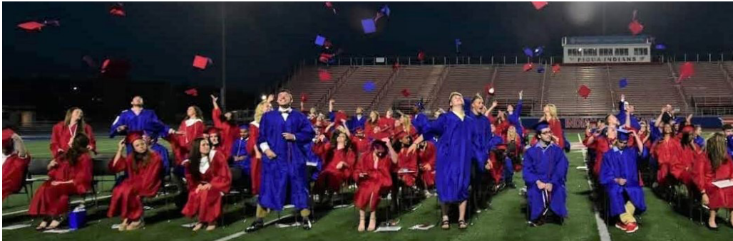
The class of 2021 celebrates with the traditional toss of their graduation caps at the conclusion of the commencement ceremony at Alexander Stadium.

(Piqua City Schools Celebrate the Class of 2021, continued)