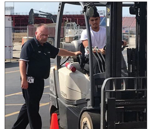
Forklift safety training in progress.