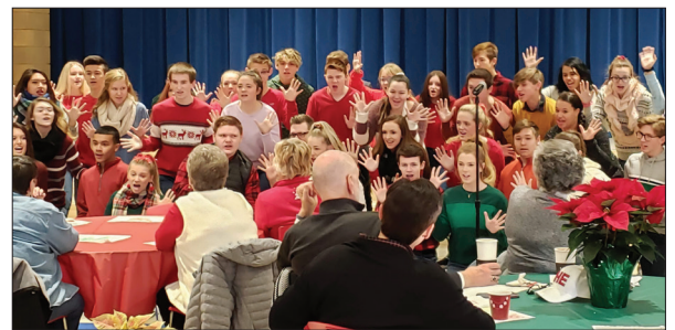
PHS Show Choir entertaining during Senior Citizen Holiday Breakfast.