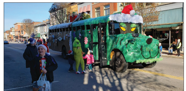
2019 Christmas Parade.