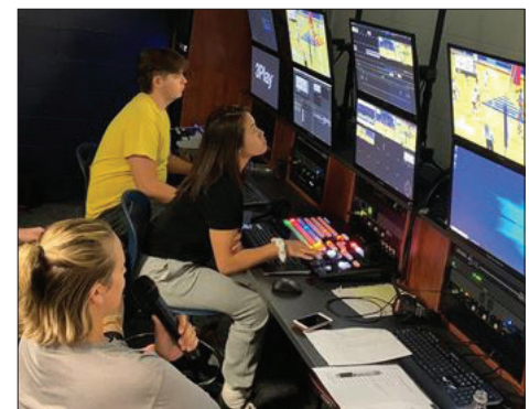
Media lab provides expert hands-on experience.