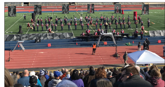
Piqua High School Marching Band Takes Honors at Contest