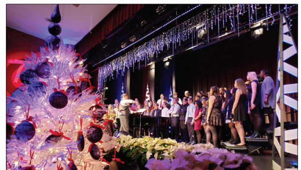
PHS Show Choir ‘The Company’ provide holiday entertainment