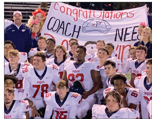
Celebrating Coach Nees' 200th Victory!